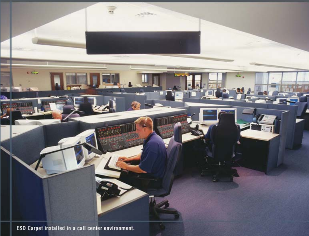
ESD Carpet installed in a call center environment.